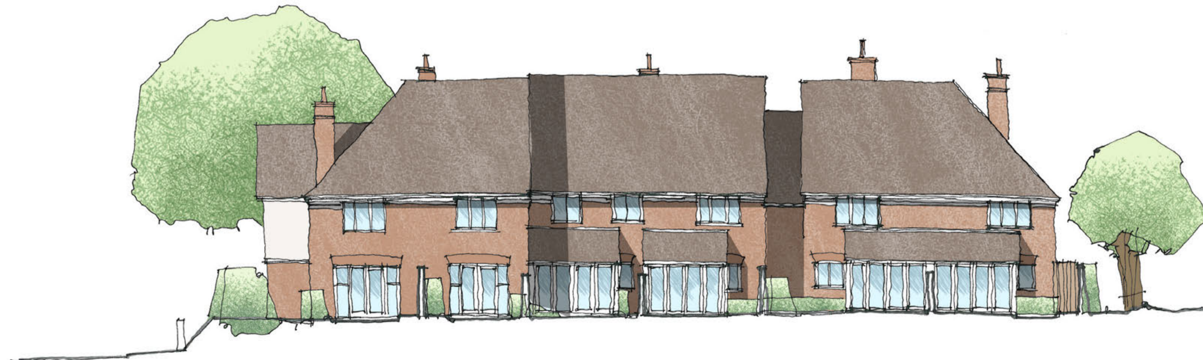
Site Sectional Elevation A-A

Unit 6 Unit 5 Unit 4 Unit 3 Unit 2 Unit 1