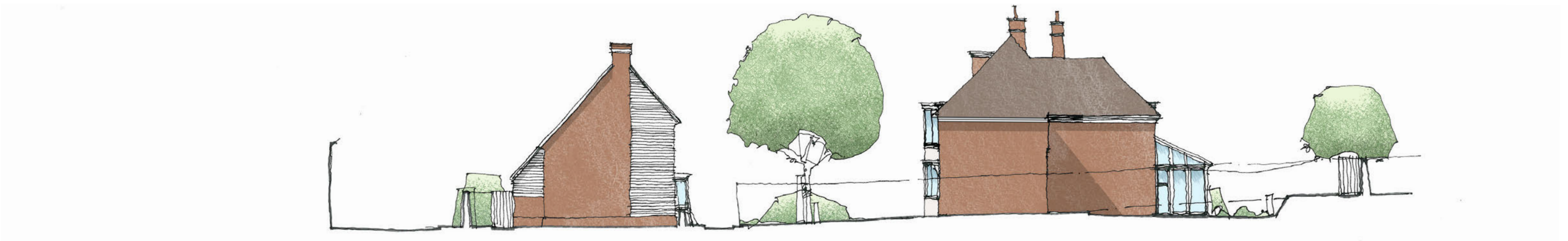
Site Sectional Elevation D-D