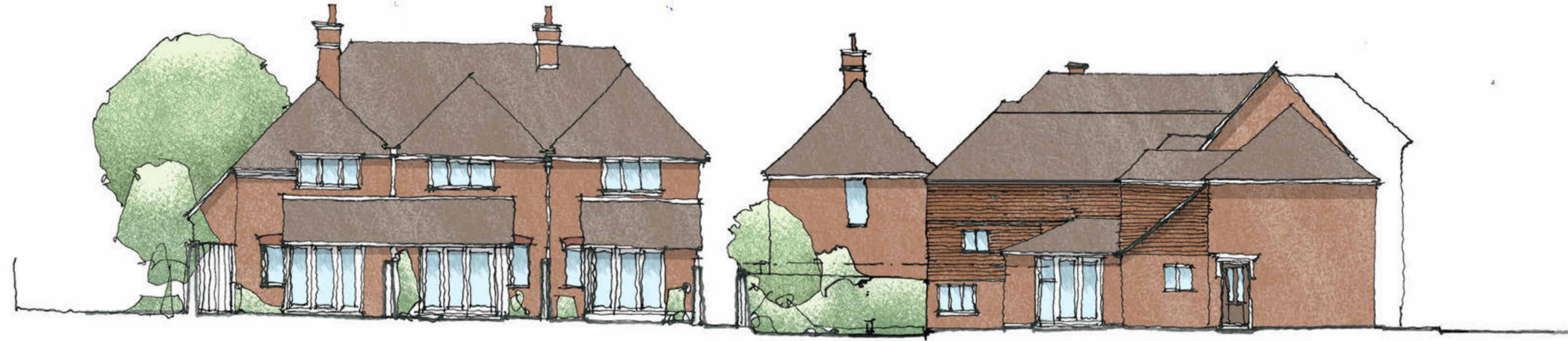
Unit 9 Unit 8 Unit 7 Unit 5 Unit 1